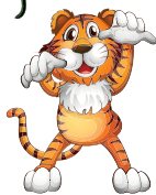
Terrific Tigers (6-11)