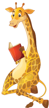
Groovy Giraffes (12-15)