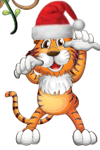
Terrific Tigers (6-11)