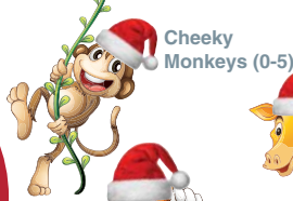
Cheeky Monkeys (0-5)

Haven't redeemed last year's Art & Hobby Voucher yet? Get 12% off online by using the code 'HSSCU19' for the rest of 2019!