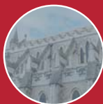
High Street Branch