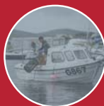
St. Gabriel's Branch (Cork)