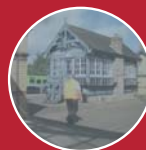
CIE Dundalk Branch

To check out our branch's opening hours, visit www.hsscu.ie