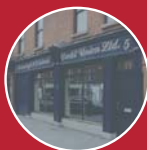
Ranelagh & District Branch