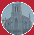
James's Street Branch