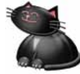
Fat Cats (12-16)