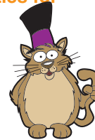
Fat Cats (12-16)